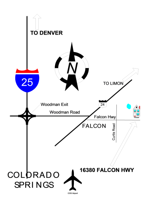
From I-25 North or South: Take Woodmen Road Exit and travel east to Highway 24. Turn Right on Highway 24 and then turn Left on Meridian. Go to stop sign and then Turn Left on Falcon Highway. Turn Left in driveway at 16380 Falcon Highway.